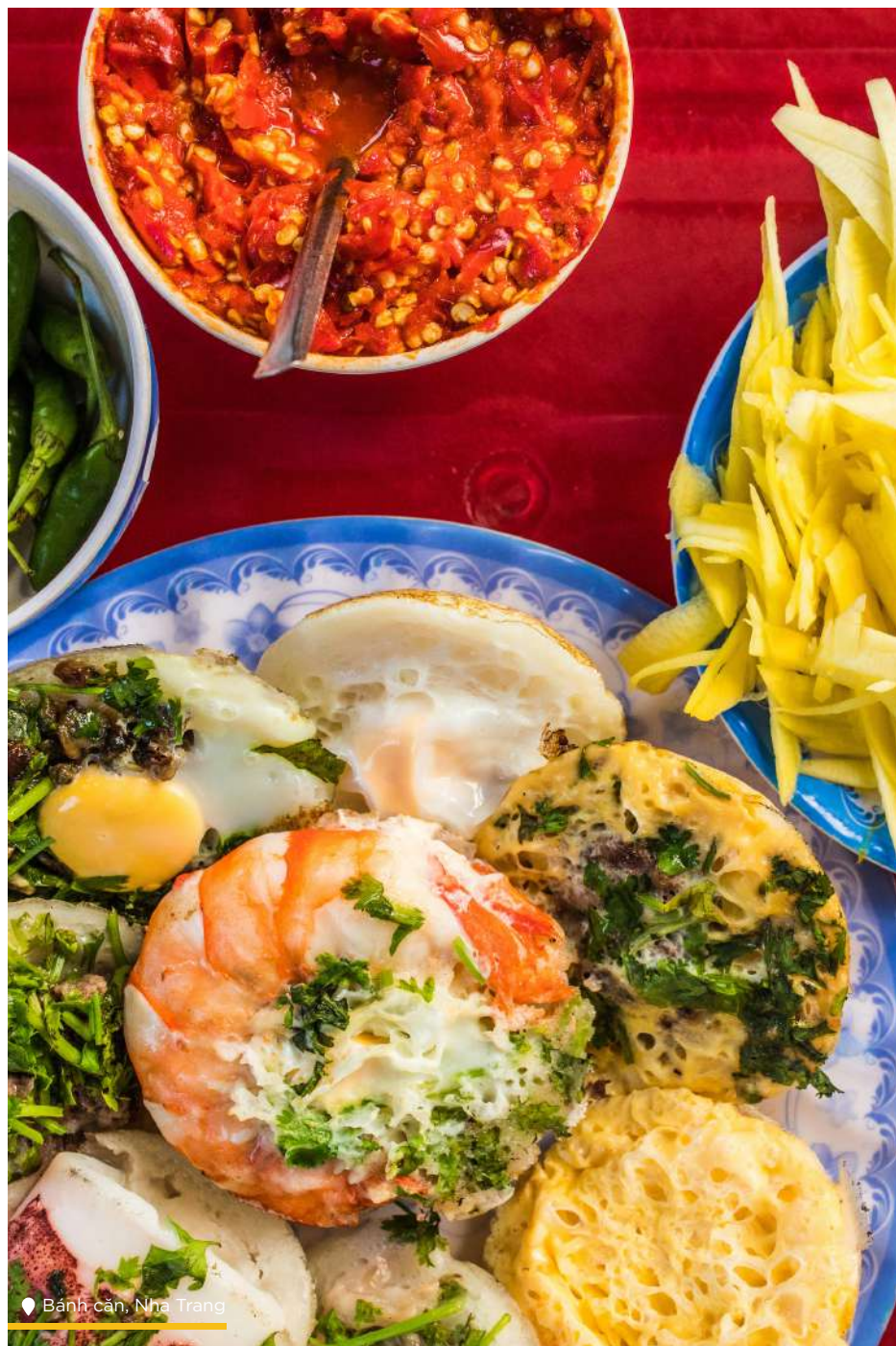
📍 Bánh căn, Nha Trang